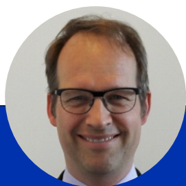
Speaker Koen Nomden

Unit on Skills and Qualifications of the European Commission